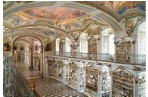
The world's largest monastery library is in the canton of Aargau in Switzerland .

A preview sale for members only will be held on October 27. So if you want to take advantage of a really, really good deal, make sure your membership is current, and for the best picks plan on arriving early.