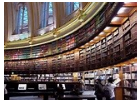
The world's largest library is reported to be the British Library.